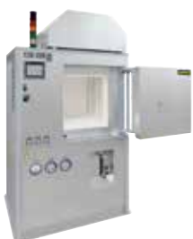
HT 160/17 DB200 for debinding and sintering of ceramics after 3D-printing