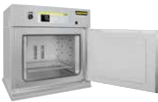
Oven TR 240 for drying of powders

In most cases, these objects must be heat treated after printing. Nabertherm offers solutions from curing for conservation of the green strength up to vacuum furnaces in which the objects of metal are annealed or sintered.