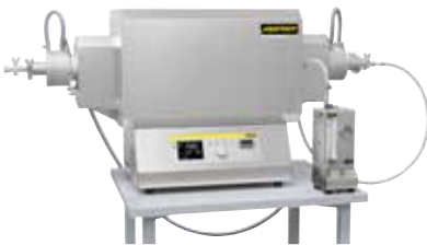
Compact tube furnace for sintering or annealing under protective gases or in a vacuum after 3D-printing