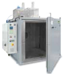
Chamber oven KTR 2000 for curing after 3D-printing